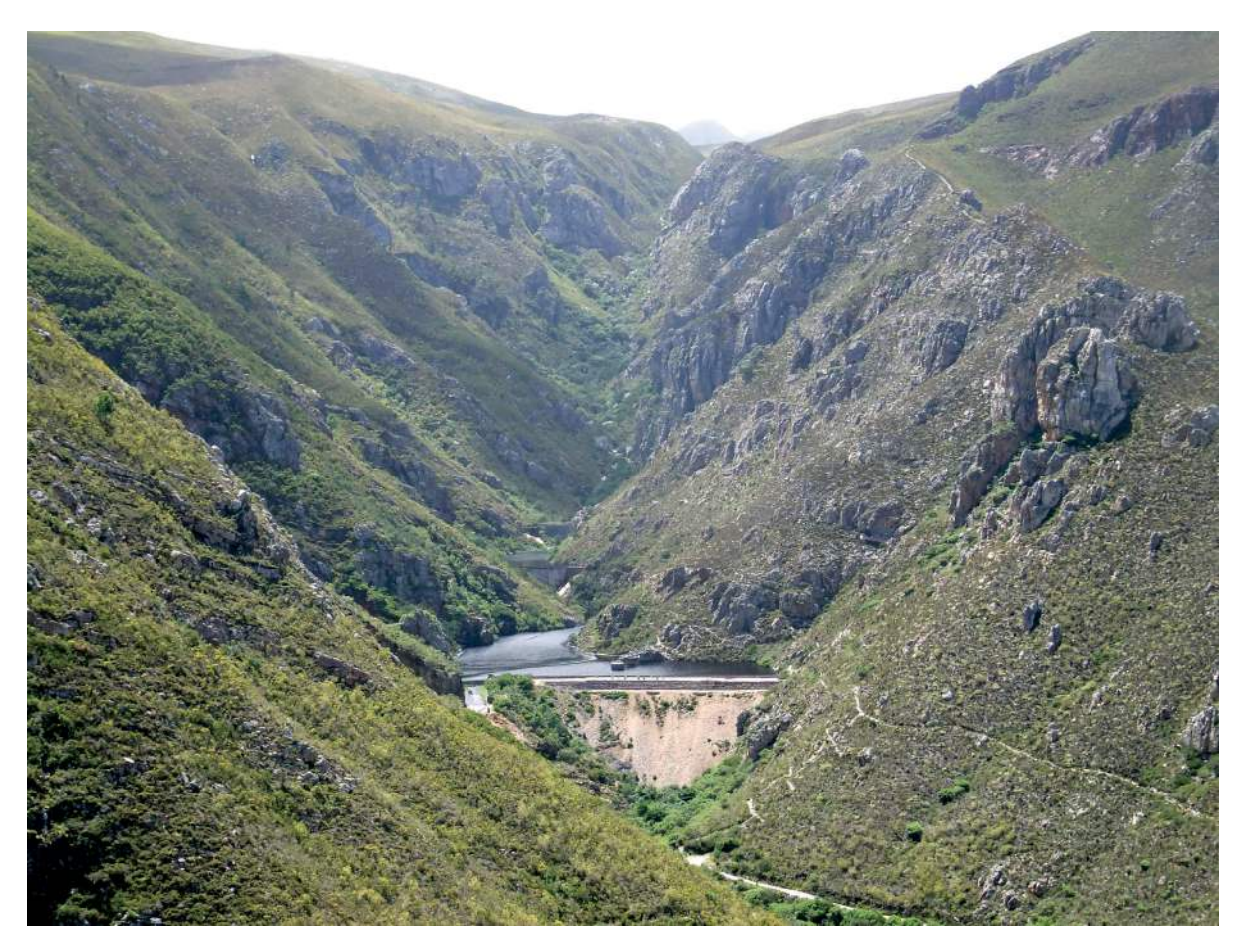
Photograph B for Question 3